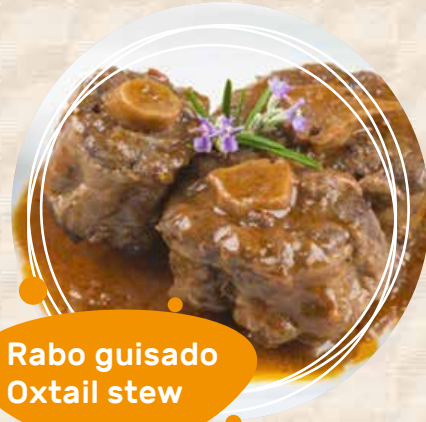
Rabo guisado Oxtail stew