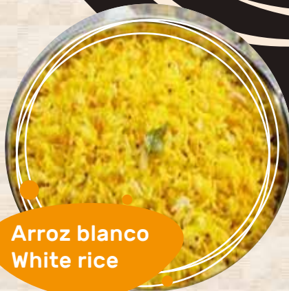
Arroz blanco White rice