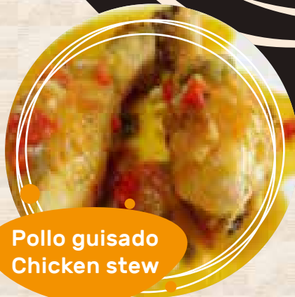
Pollo guisado Chicken stew