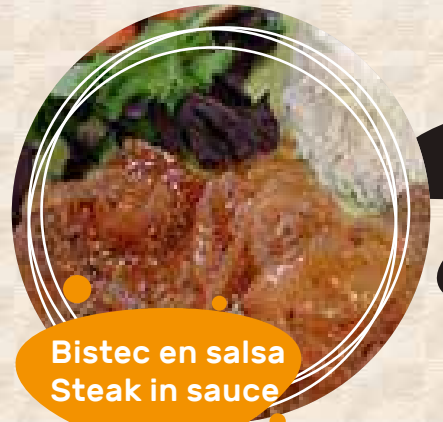
Bistec en salsa Steak in sauce