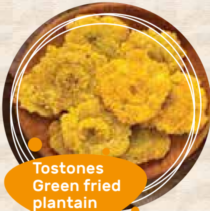
Tostones Green fried plantain