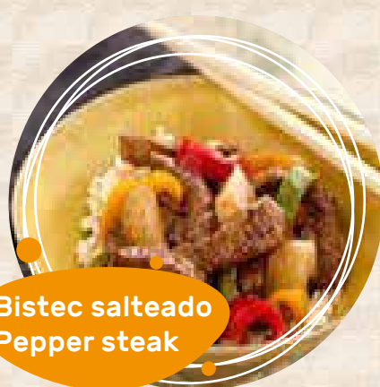
Bistec salteado Pepper steak