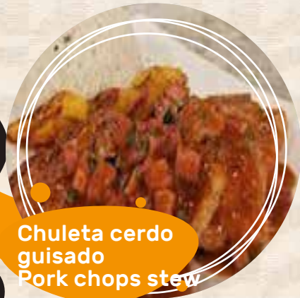
Chuleta cerdo guisado Pork chops stew