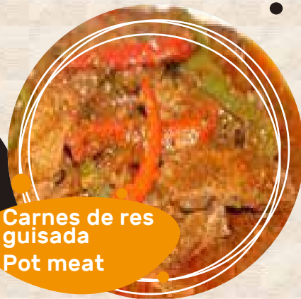
Carnes de res guisada Pot meat