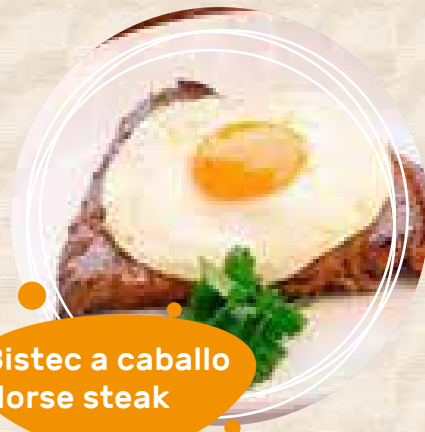
Bistec a caballo Horse steak