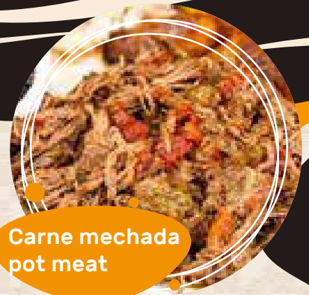
Carne mechada pot meat