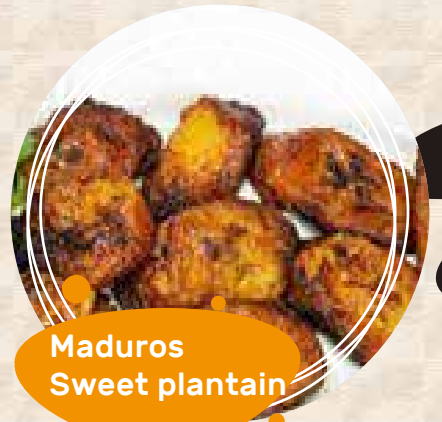
Maduros Sweet plantain