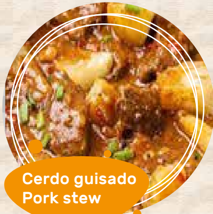
Cerdo guisado Pork stew