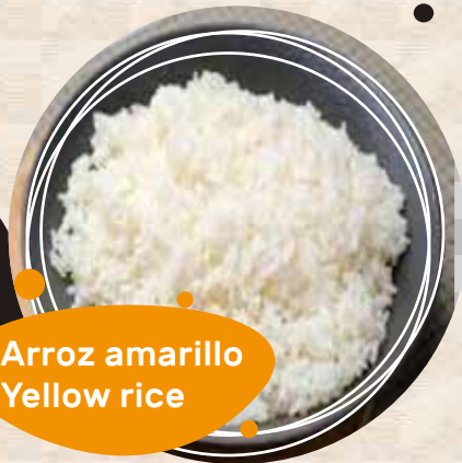
Arroz amarillo Yellow rice